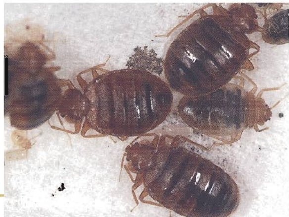
Bed bugs and their eggs (center of the photo).

Adult bed bugs are about 1/4-inch long and reddish-brown, with oval,