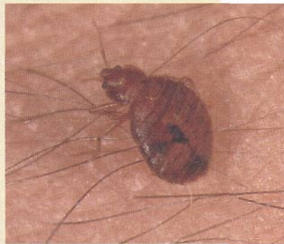
Disease transmission by bed bugs to humans is considered highly unlikely.

A common concern with bed bugs is whether they transmit diseases. Although bed bugs can harbor pathogens in their bodies, transmission to humans is considered highly unlikely. For this reason, they are not considered a serious disease threat. Their medical significance is mainly limited to the itching and inflammation from their bites. The usual treatment prescribed is topical application of antiseptic or antibiotic creams or lotions to prevent infection.