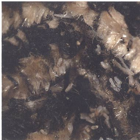
Far left: A pest management professional inspecting an infested couch. The other two images show close-ups of bed bugs and eggs within the fabric.